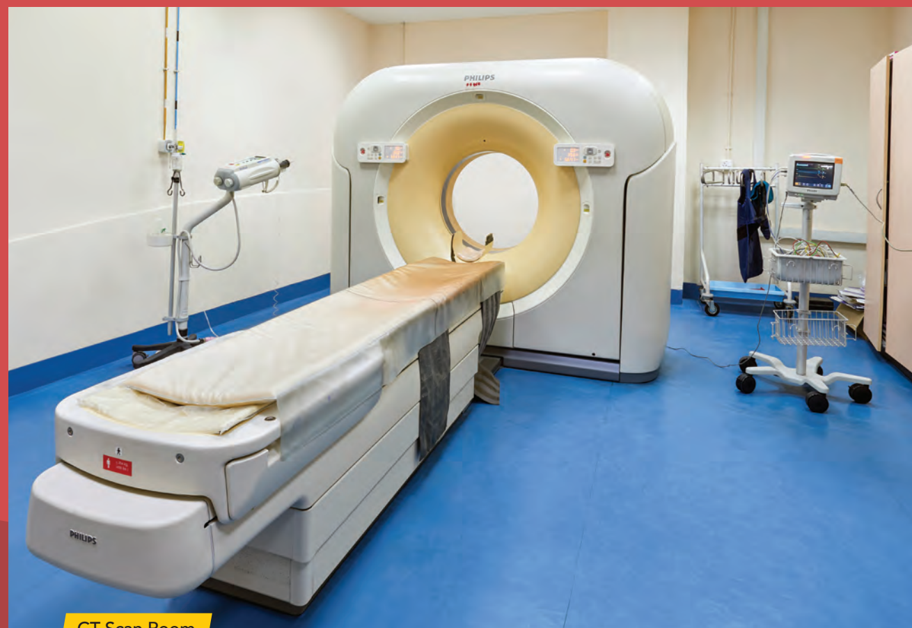
CT Scan Room