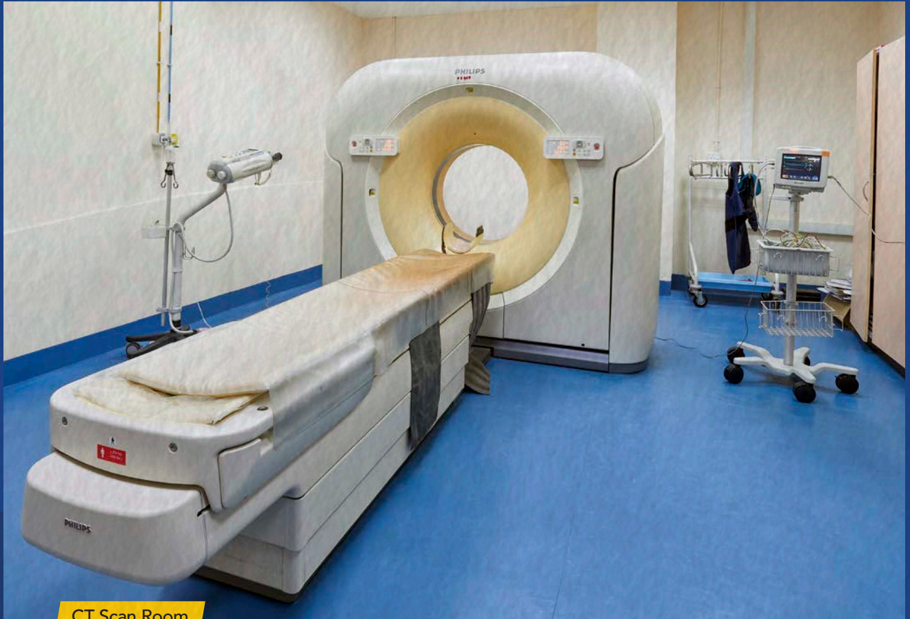
CT Scan Room